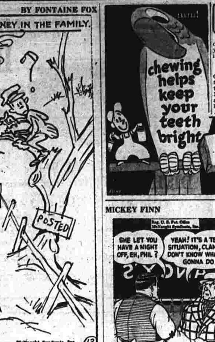
Sense and Nonsense