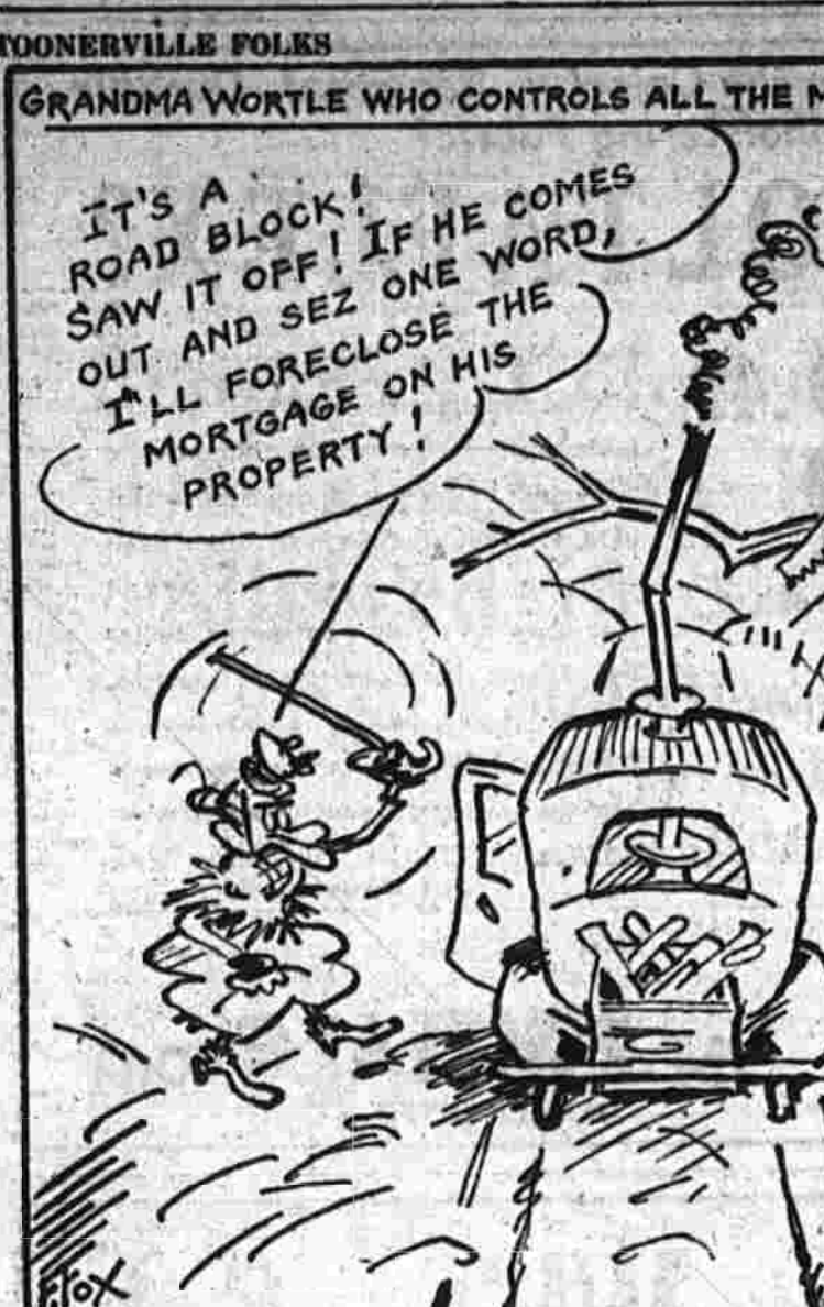
TOONERVILLE FOLKS BY FONTAINE FOX