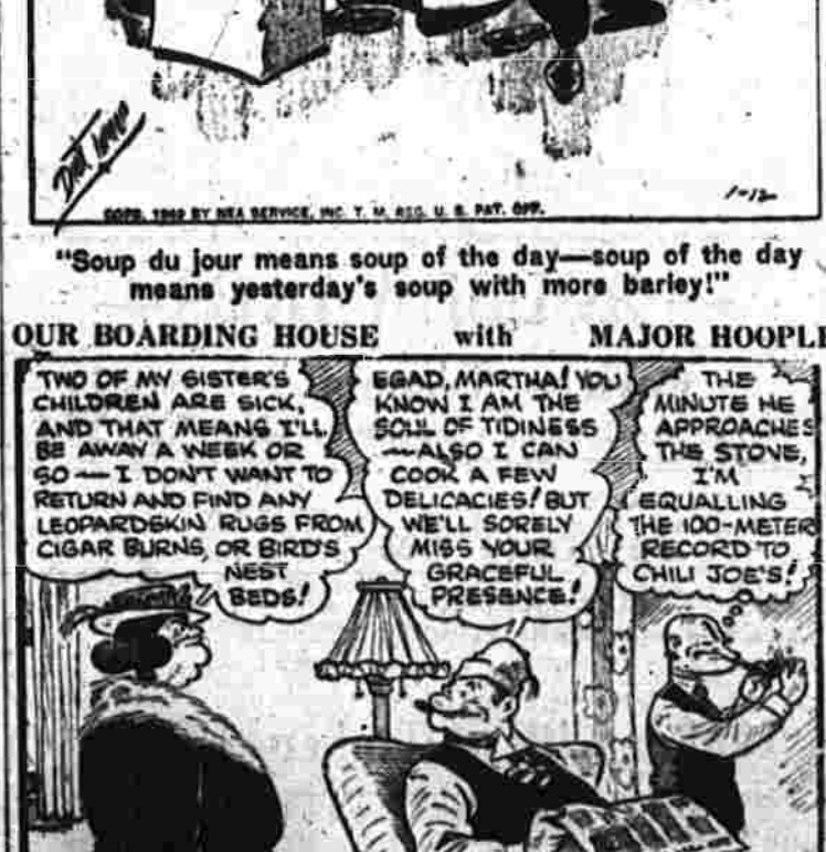
OUR BOARDING HOUSE BY MAJOR HOOPLE