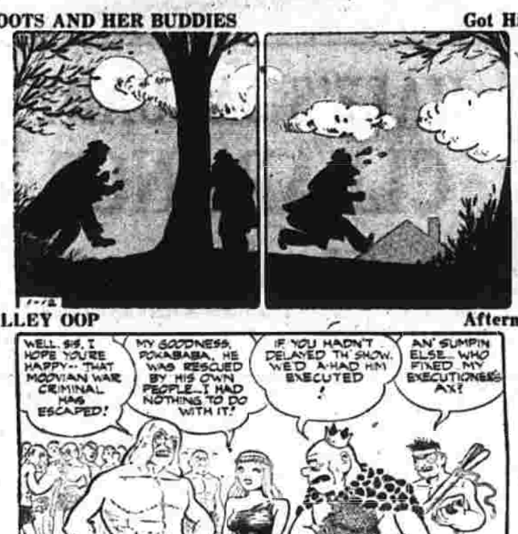
ALLEY OOP BY V. T. HAMLIN