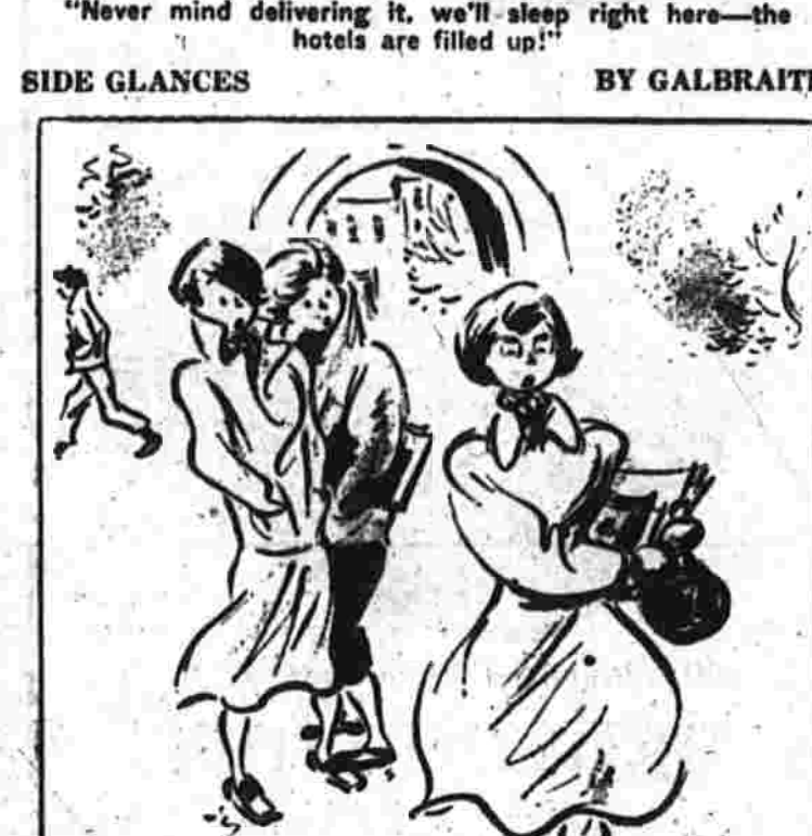
SIDE GLANCES BY GALBRAITH