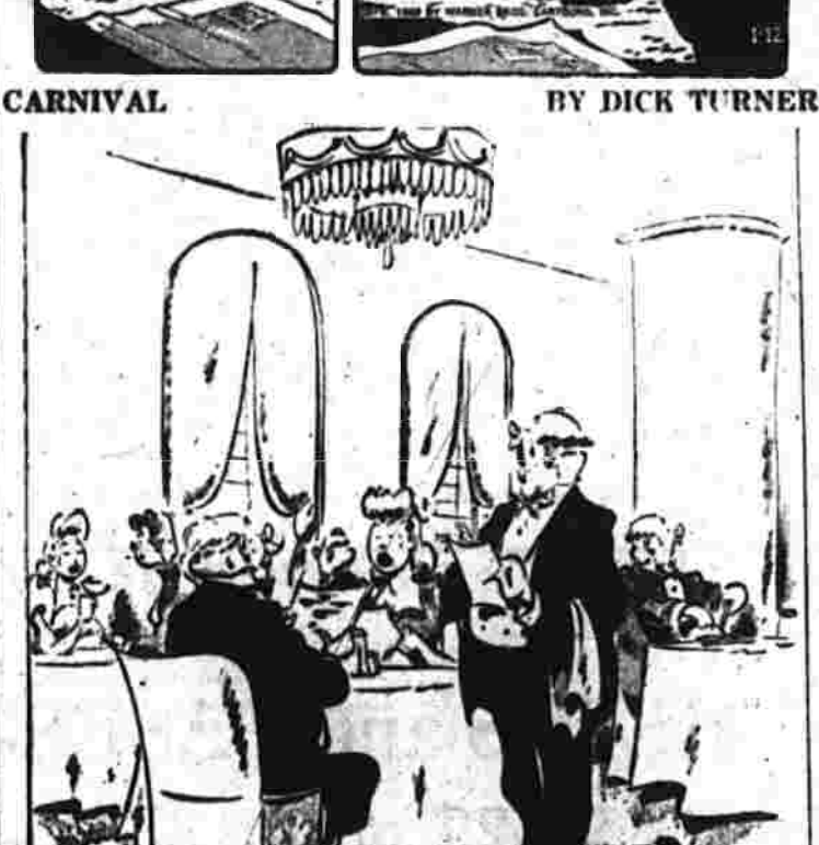
CARNIVAL BY DICK TURNER